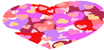
FEBRUARY IS HEALTHY HEART MONTH